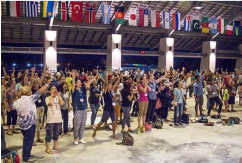
500 People from 43 Countries Celebrate New University of the Nations Campus at Battambang, Cambodia in January

Join YWAMers around the globe in praying and hearing from God. He is inviting you!