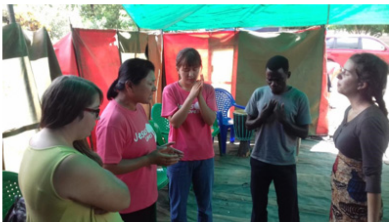
Representatives from YWAM Blantyre, YWAM Kona and YWAM Hernhutt Praying in Malawi in January during The Invitation