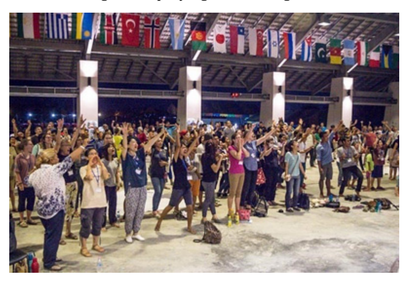
500 People from 43 Countries Celebrate New University of the Nations Campus at Battambang, Cambodia in January

Join YWAMers around the globe in praying and hearing from God. He is inviting you!