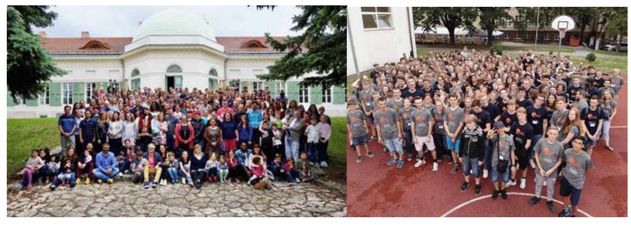
Left to right, top to bottom: YWAM's workers in Greece; YWAM Romania Staff Gathering; YWAM Central Europe Staff Gathering; Young missionaries From Germany, Poland, USA and Eqypt Gather in Warsaw