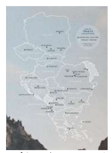
Map of Central Europe Locations

Please join YWAM's global prayer day, called The Invitation, this month and pray for Central Europe. You are particularly invited to pray during our prayer day, July 11. If you only have a few moments to pray please pray for unity and reconciliation in and among these nations. Pray also for those that are lost, marginalized and victimized in Central Europe. We would love to receive stories from you regarding how you prayed. You can email us at prayer@ywam.org.