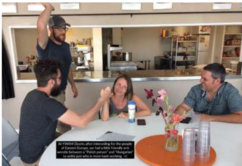
YWAM Ozarks Prayed for Central Europe in July