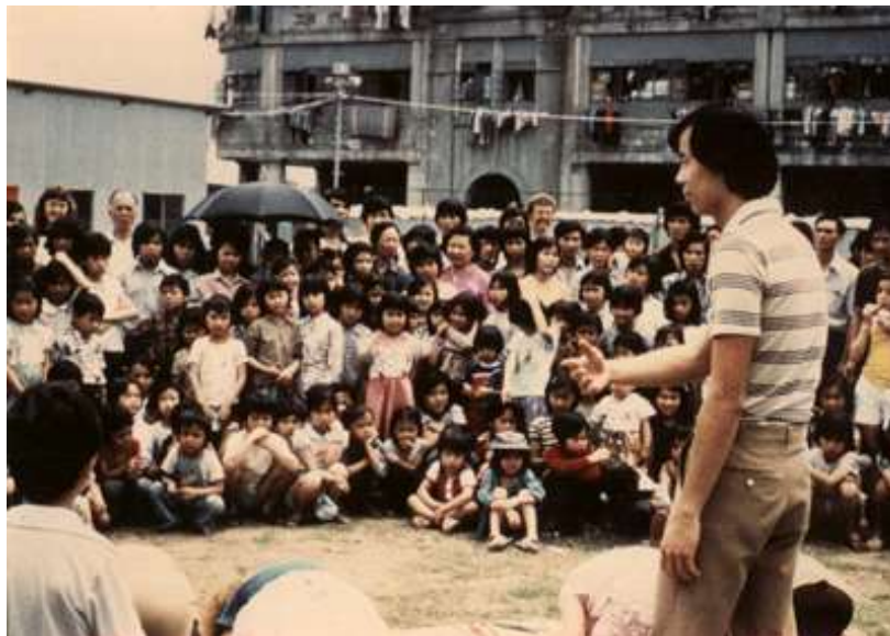
Far East Evangelism Team - Outreach to Refugee Camp

Take time to celebrate and be full of gratitude for what God has initiated and brought to pass over these past 60 years.