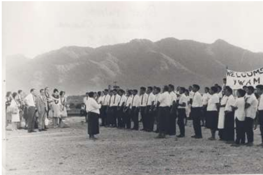
First YWAM Crusade – Samoa – 1965

Join YWAMers around the globe in praying and hearing from God. He is inviting you!