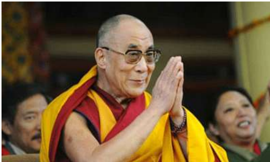
The Dalai Lama.