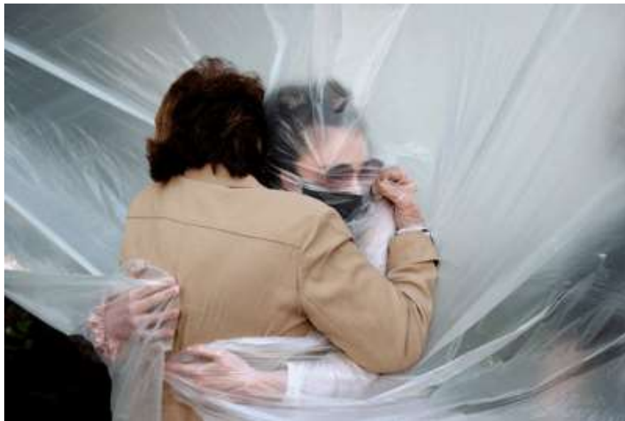
Family Members Hug Through Plastic During COVID-19 Pandemic

Join YWAMers around the globe in praying and hearing from God. He is inviting you!